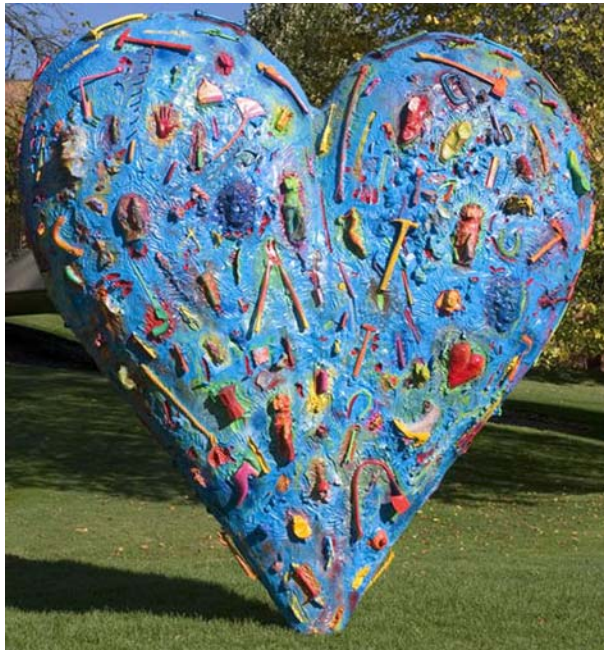
Technicolor Heart by Jim Dine, 12 foot bronze sculpture cast at the Walla Walla Foundry.